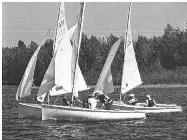
4 Year End 2007